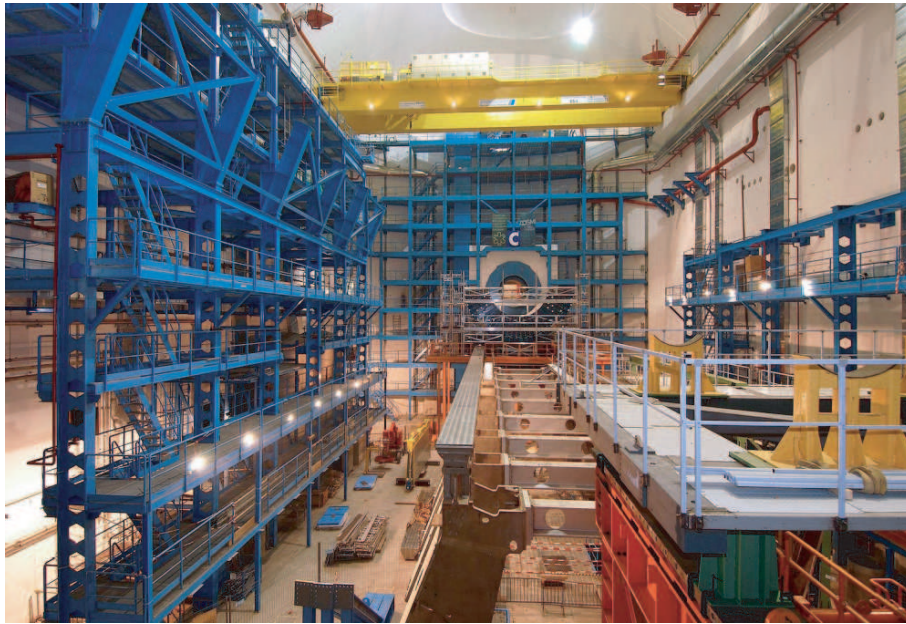
FIG. 5: ATLAS underground experimental cavern, status May 2004. Visible is the half cylinder of the barrel Tile Calorimeter, which has been assembled underground since March 2004.

a major input to the estimates for the future resources requirements. Even though DC2 is progressing steadily, the large-scale operation is also revealing several areas where improvements need to be achieved in order to reach the planned efficient and smooth running of the collaboration-wide computing for LHC turn-on. The DC2 is embedded into the framework of the CERN LHC Computing Grid Project (LCG). In fact ATLAS is a very active partner in the LCG.