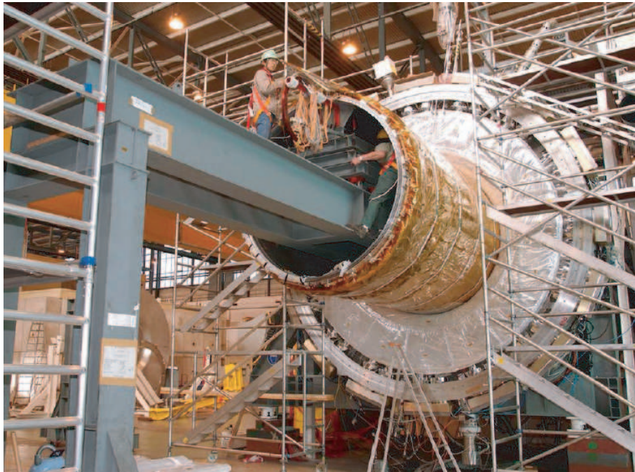
FIG. 3: LAr barrel calorimeter fully assembled. The central solenoid is being inserted into the common cryostat. In July 2004 this system has been cooled down and the solenoid was energized to its full current, including an 8% safety margin.