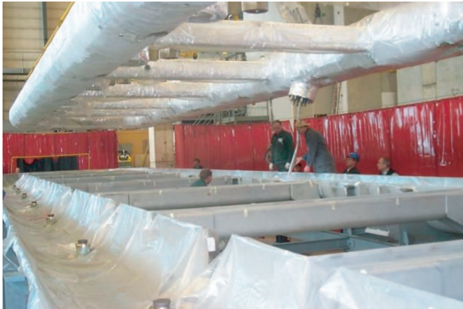
FIG. 2: Insertion of the second BT coil in its cryostat. The coil cold mass and thermal shielding are inside the multilayered insulation system wrapped around them.

ing subjected since end 2002 to final radiation qualification tests in the dedicated X5 beam irradiation facility at the CERN SPS, and is showing good results throughout. The end cap regions are instrumented with Thin Gap Chambers (TGC) that are able to cope with high rates. The TGC series fabrication is well advanced, with more than 87% of all chambers assembled, and 50% of them fully tested. More than 1/3 of all chambers have arrived to CERN. The trigger chamber electronics was validated in a system test using an LHC-like beam structure in the SPS beam, after an initial run which uncovered some, by now well understood and corrected, problems.